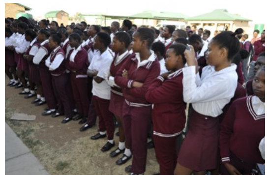
Phaphama Mzansi, an Anti-Substance group performing for the school learners to uplift their spirit.