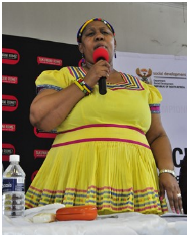
Deputy Minister for social Development, Ms Hendrietta Bogopane-Zulu addressing the Men's Parliament in Modimolle.

The two interventions form part of the Boys and Men Championing Change programme which is implemented under the banner of Takuwani Riime Men's Movement. The initiatives are anchored in the belief that achieving gender equality is about transforming unequal power and gender relations