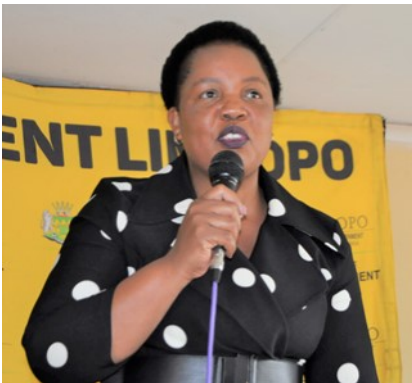
MEC for Social Development, Mme Nkareng Rakgoale giving a keynote address during the International Men's Day.

The number of women abused and killed in South Africa over recent weeks has ignited outrage, street protests and a media storm. The extent of the scourge of gender-based violence is tearing apart families and leaving behind a negative effect. The MEC for Social Development, Mme. Nkareng Rakgoale during the commemoration of International Men's Day held in Capricorn District in cooperation with the SADC Unified Ancestors and Traditional Practitioners Association, said the Department will launch district men's forums in all five districts of Limpopo to appropriately address the scourge of gender based violence. This will create a platform for men to discuss about issues that are affecting them that lead to being involved in gender based violence. During the commemoration of 16 days of no violence against women and children, 12 women and children have been killed in a space of two weeks. The MEC urged community members and especially men to lead the fight against gender based violence.