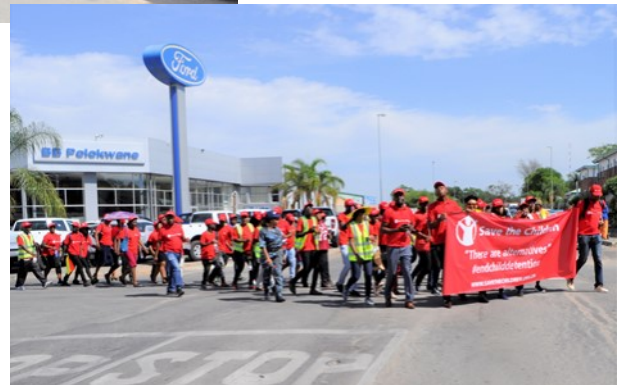
An awareness campaign march for the protection of child from being detain under the theme “There are alternatives” endchilddetention.