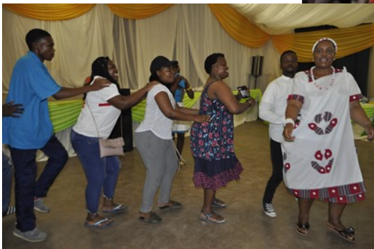
“Haka Matorokisi” with MEC.