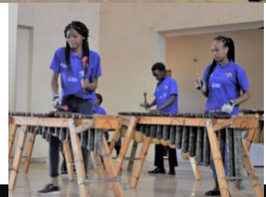
Various performance took place including young and vibrant cultural group dances and an older persons choir, which the MEC joined in a jubilant atmosphere.